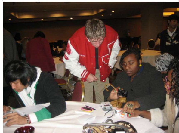
NSF Workshop in Atlanta