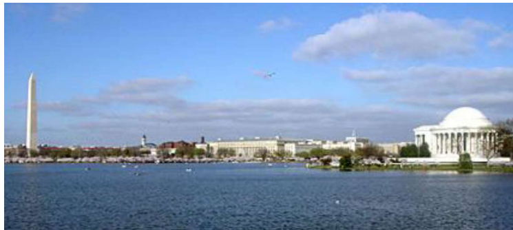
The National Mall

For over 50 years, the American Control Conference (ACC) has been the premier technical conference in North America in the automatic controls area, and the ACC has enjoyed strong international participation that significantly enhances the conference. The 2013 American Control Conference will be held in Washington, D.C. While the ACC has been held in nearby cities in the past, this will be the first ACC in the capital city of the United States of America. The 2013 ACC will be held at the Renaissance Hotel, centrally located in downtown Washington, D.C. within 7 blocks of the White House, the US Capitol building, the National Mall, and the Smithsonian Institution. The hotel is also within 2 blocks of an extensive restaurant district. The traditional conference banquet will be transformed to an evening at the National Air and Space Museum (NASM) on June 18, 2013. ACC attendees and their guests will have exclusive use of the museum for the evening, including screenings of shows in NASM's IMAX Theater and Planetarium.