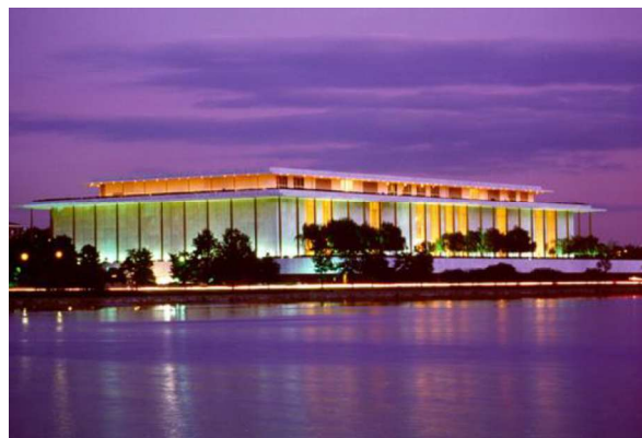
Kennedy Center

The ACC is held in cooperation with the International Federation of Automatic Control (IFAC) and is sponsored by the eight member societies of the American Automatic Control Council (AACC): AIAA, AIChE, ASCE, ASME, IEEE, ISA, SCS, and SIAM. Volunteers from these societies form the backbone of the AACC and ACC, and their efforts have allowed the organization and conference to flourish over the years. ACC is a conference that provides a forum for bringing industry and academia together to discuss the latest developments in the area of automatic control systems, from new control theories, to advances in sensors and actuator technologies, to new application areas for automation. We welcome ideas you may have for enhancing the quality and goals of the 2013 ACC, and we encourage you to organize special sessions and make technical contributions to the 2013 ACC.