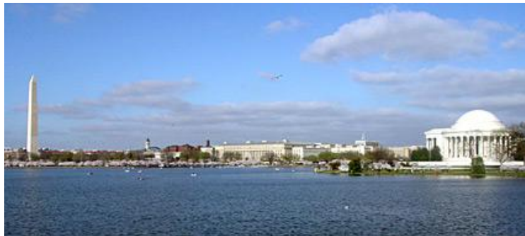
The National Mall

For over 50 years, the American Control Conference (ACC) has been the premier technical conference in North America in the automatic controls area, and the ACC has enjoyed strong international participation that significantly enhances the conference. The 2013 American Control Conference will be held in Washington, D.C. While the ACC has been held in nearby cities in the past, this will be the first ACC in the capital city of the United States of America. The 2013 ACC will be held at the Renaissance Hotel, centrally located in downtown Washington, D.C. within 7 blocks of the White House, the US Capitol building, the National Mall, and the Smithsonian Institution. The hotel is also within 2 blocks of an extensive restaurant district. The traditional conference banquet will be transformed to an evening at the National Air and Space Museum (NASM) on June 18, 2013. ACC attendees and their guests will have exclusive use of the museum for the evening, including screenings of shows in NASM's IMAX Theater and Planetarium.