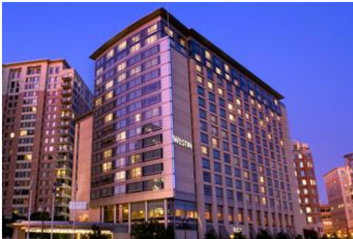
Westin Arlington Gateway Hotel

For the most current information, visit the conference website: http://www.dsc-conference.org .