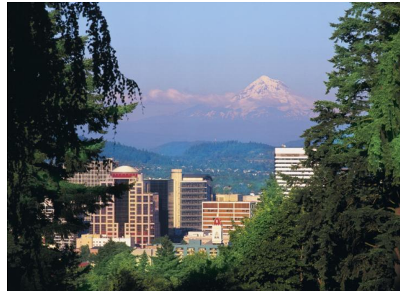
Portland Skyline

Portland is frequently recognized for its environmentally-friendly practices and ranks among the world's top 10 greenest cities. Public transportation is excellent -- and free within the vibrant downtown area. There are plenty of good restaurants (Portland was recently chosen as the "Delicious Destination of the Year"), in addition to the well-known micro-breweries and coffee