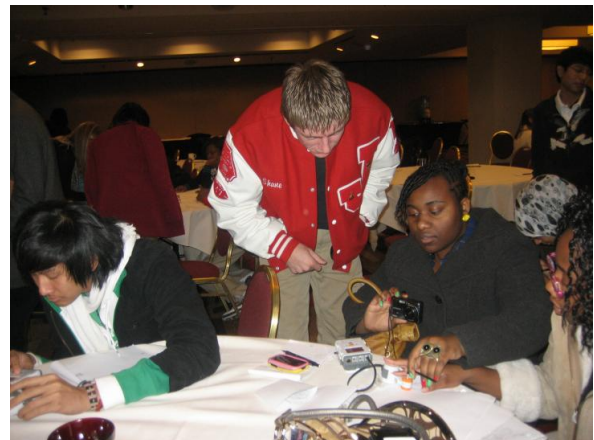
NSF Workshop in Atlanta